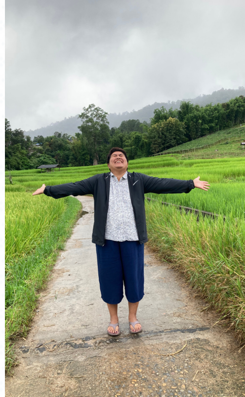
The director of a grassroots feminist group enjoys a moment in nature during a PA-supported exchange with an indigenous women’s organization (Hing Hoy Noy)