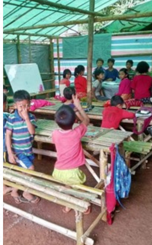
Children displaced by war study in a makeshift school supported by PA in 2023 (Local Partner)

Minimizing Red Tape: One of our partners' biggest complaints is how long it takes for donor resources to reach them, and how funding is often structured in a way that makes it impossible to meet actual needs. That's why we have developed responsive and streamlined grant-making processes based on needs and context.