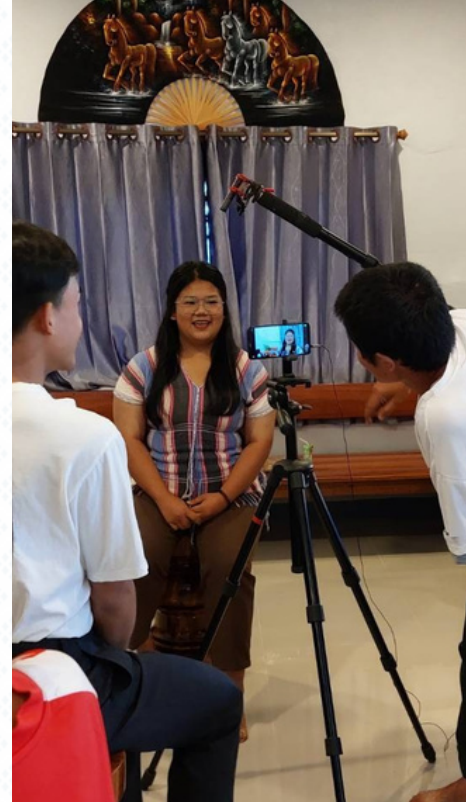
Indigenous youth leaders participate in a locally-led documentary workshop sponsored by PA in Thailand in 2023

PA hosted documentary screenings and partner meetings and conferences to identify and pursue shared goals toward more equitable, inclusive, and mutually respectful aid partnerships.