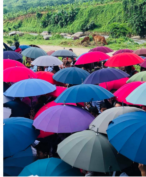
Displaced persons gather to accept locally distributed aid during the rainy season

Engaging with our supporters and strategizing with local networks, in just five days Partners Asia raised more than $40,000 in humanitarian assistance for our partners already on the ground and ready to respond.