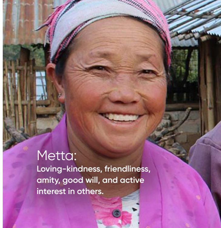
Metta: Loving-kindness, friendliness, amity, good will, and active interest in others.

Our work is not about benevolence and charity, but about developing equitable partnerships.